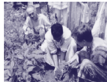
Organic gardening for herbs at Wise Earth School

Inner medicine healing is preventative medicine in its truest form. It strives to educate the individual to take responsibility for their own health and well being, to make healthful choices in their lives, and to cultivate their intrinsic power to heal themselves and to live in harmony with all things. Ayurveda in Wise Earth Tradition - the inner medicine educational model demonstrates the paramount role individual health and harmony play in the cultivation of world peace.