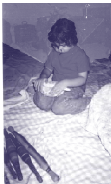
Children gleefully partake in kneading and rolling flatbreads in the Nutrition program at MOM