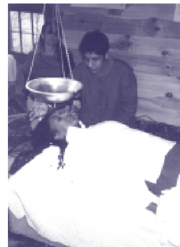
Community member receiving shirodhara therapy at MOM's mission

The Vedic seer informs that good health will not be found outside ourselves, it is a natural state of being in the form of the “true self.” Once we realize the true self to be a conscious entity, intrinsically whole – we may eliminate the sense of separation which is the cause of disease, disharmony and unhappiness.