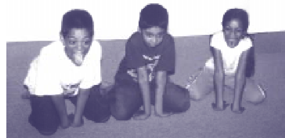
Children practicing Play Yoga™ at MOM